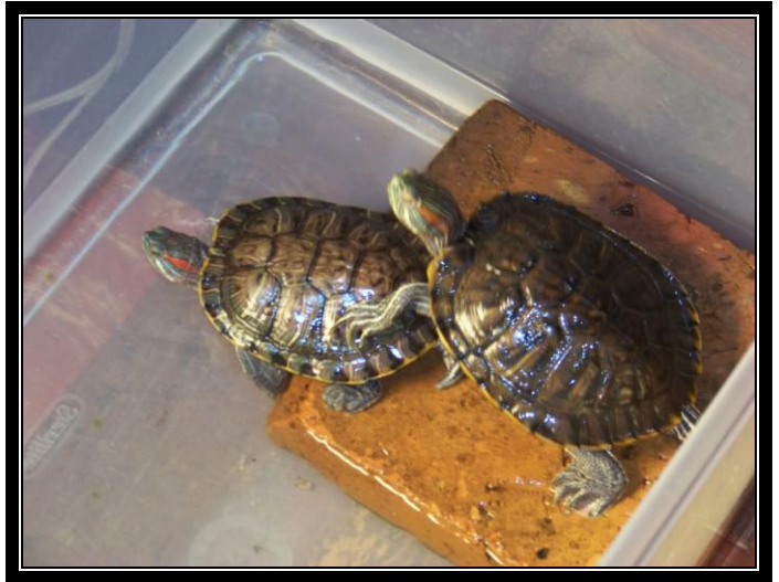
Red-Eared Slider (Trachemys scripta elegans) Roy Hyatt Environmental Center, Cantonment, FL