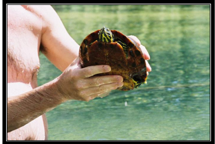
Yellow-Bellied Slider (Trachemys scripta scripta) Left: Escambia River, Florida – Right: Blue Springs, AL

A close relative of the Cooters, Sliders are one of the more commonly encountered turtles by Floridians exploring our great state. As mentioned in the Turtle Fact Sheet on Cooters, Sliders were once listed in the same genus – but now most biologists place them in their own, called Trachemys . They can be distinguished from Cooters ( Pseudemys ) by their more round plate-shaped carapace (not as oval as Cooters) and they are also smaller (sliders CL = 25cm, cooter CL = 30-35cm). They have numerous dark markings on the plastron, and a large yellow patch on the cheek behind their eye (photo above). There are two subspecies of sliders found in the United States and both are found in Florida. The Red-Eared Slider ( Trachemys scripta elegans ) has a red patch behind the eye instead of the yellow. These are common in the Mississippi Valley area until you reach the hilly piedmont range of Alabama. In the coastal plain area of the extreme southeast U.S. below the Piedmont is the range of the yellow-bellied slider ( Trachemys scripta scripta ). This turtle is found in the panhandle of Florida but does not exist south of the Suwannee River.