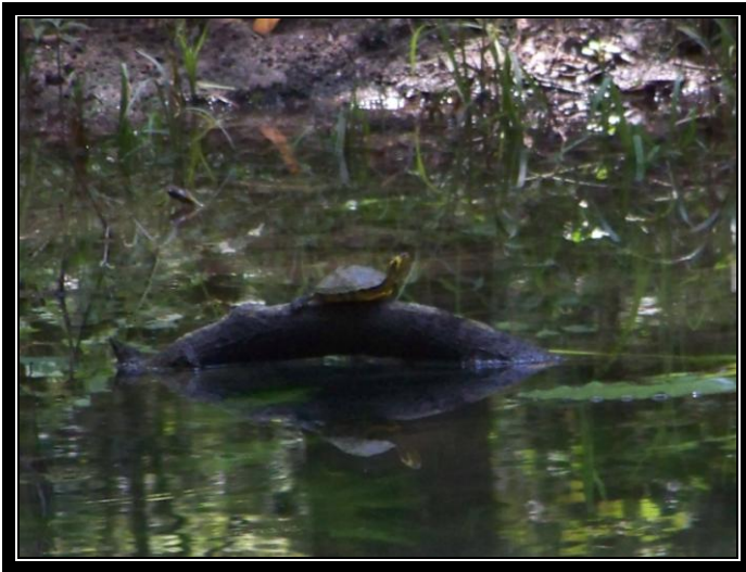
Yellow-Bellied Slider (Trachemys scripta scripta) Rainbow Springs State Park, FL

The Red-Eared Slider is certainly listed as an exotic species (non-native) in the state of Florida but whether it is an invasive species (causes ecological or economic problem), as with so many others in this state, is still unknown.